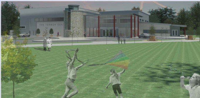
Artist's impression of what the community centre at Pettigo will look like when completed.

"Most of us do this automatically, ensuring all are treated equally. At other times, maybe we need the skills to