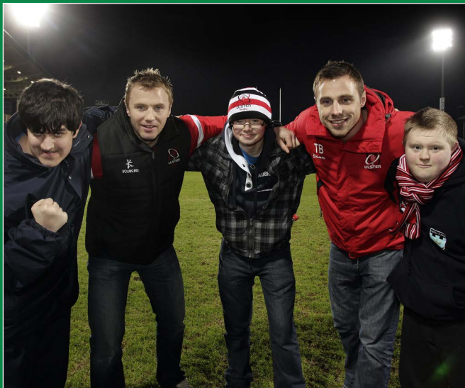
Three of the young participants in the project with Tommy Bowe and Roger Wilson from the Ulster Rugby squad at Ravenhill, during the Ulster v Ospreys game.

The schools attract young people from across a number of council areas and from diverse backgrounds and communities including The Glens, Dunloy, Coleraine estates, Bushmills, Macosquin, and Ballymena. They have come together