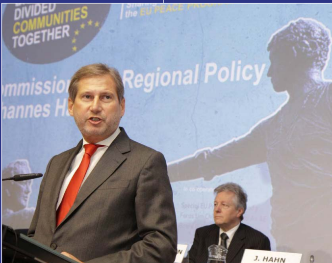
EU Commissioner for Regional Policy, Johannes Hahn, speaking at the ‘Bringing Divided Communities Together’ conference in Brussels.

First Minister, Peter Robinson MLA, and deputy First Minister, Martin McGuinness MLA, who both addressed guests at the reception organised by the Brussels office, also had the opportunity to meet representatives from the different projects.