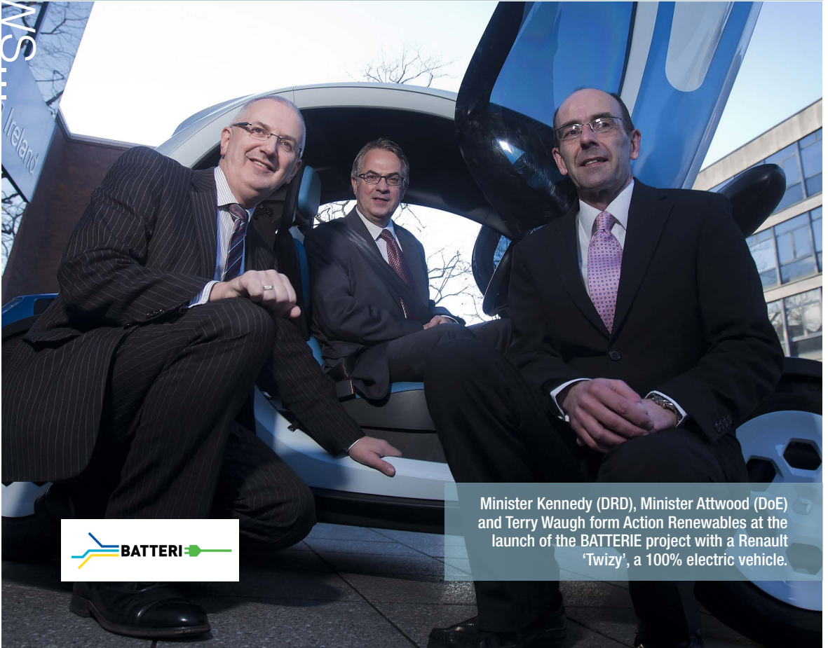
Minister Kennedy (DRD), Minister Attwood (DoE) and Terry Waugh form Action Renewables at the launch of the BATTERIE project with a Renault 'Twizy', a 100% electric vehicle.

With rising utility prices and energy security issues topping national and regional agendas, BATTERIE focuses on providing answers to the most pressing issues affecting member states. This includes hot topics such as the future impact of rising fuel costs and fuel shortages, and identifying how smart technologies and alternative fuel use can rise to meet future challenges.