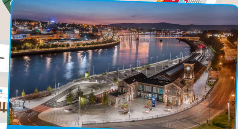
The award demonstrates good practice in regional development and acts as an inspiration to other regions.

The Department for Infrastructure, Northern Ireland and the Department for Transport, Ireland.