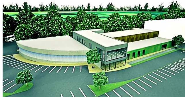
3D render of the proposed indoor sports arena

The newly developed site will be available to a wide number of groups including: community groups; youth groups; schools; churches; sports clubs; and residents from across Belfast, while integrating them with the 'public safety services' family. The project aims to promote cross-community reconciliation and community support for public security & safety services, delivering these by active engagement and participation in sport.