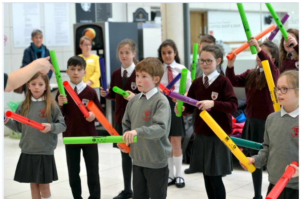
Pupils from Ballydown Primary School (Banbridge) and St. Francis Primary School (Loughbrickland) at the launch of the CASE project.

“The reconciliation element in Shared Education is of vital importance to our society, but this CASE project is also designed to deliver positive educational outcomes. There is a strong focus on the sharing of professional expertise, making better use of limited resources and community engagement.”