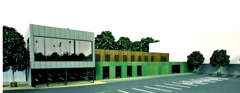
3D render of the proposed indoor sports arena

The newly developed site will be available to a wide number of groups including: community groups; youth groups; schools; churches; sports clubs; and residents from across Belfast, while integrating them with the 'public safety services' family. The project aims to promote cross-community reconciliation and community support for public security & safety services, delivering these by active engagement and participation in sport.