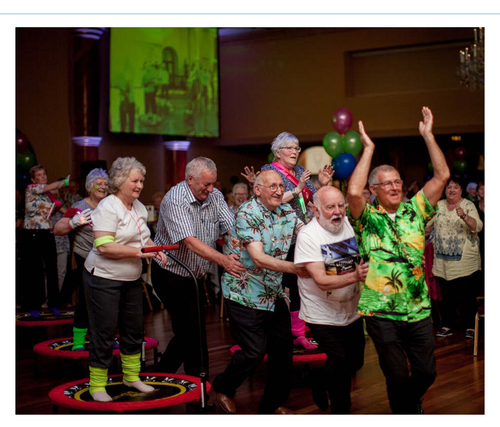
Over 300 older people gathered to celebrate the friendships and achievements as part of the Peacing Ages Together project.

Participants on the Mid & East Antrim Agewell Partnership's Peacing Ages Together project