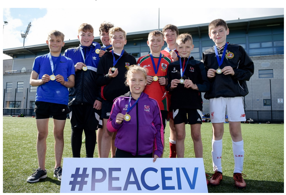
Participants on the Game of Three Halves sports project receiving their medals on completion of the programme.