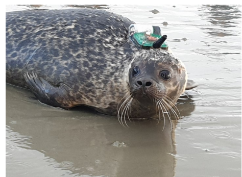
The tracker attached to the seal