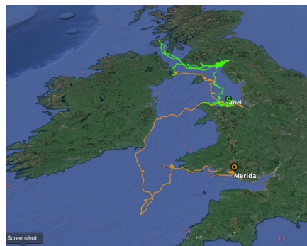
Ariel and Merida tracking Data