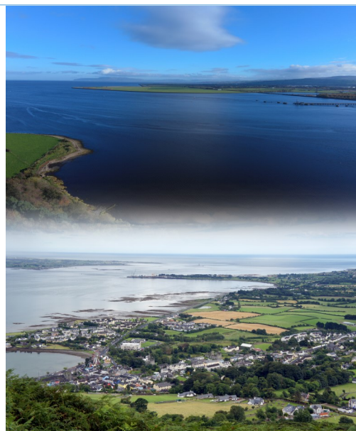
Loughs Aerial View