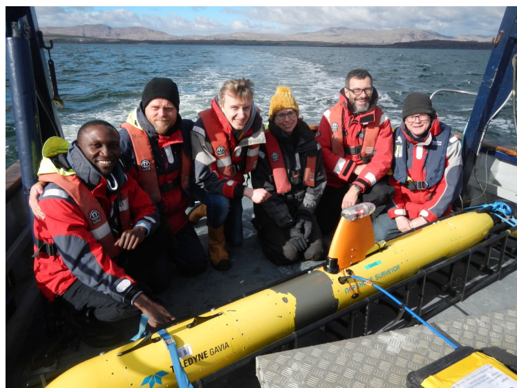
A team of MarPAMM scientists on expedition to improve habitat mapping by using the Autonomous Underwater Vehicle 'Freya'.