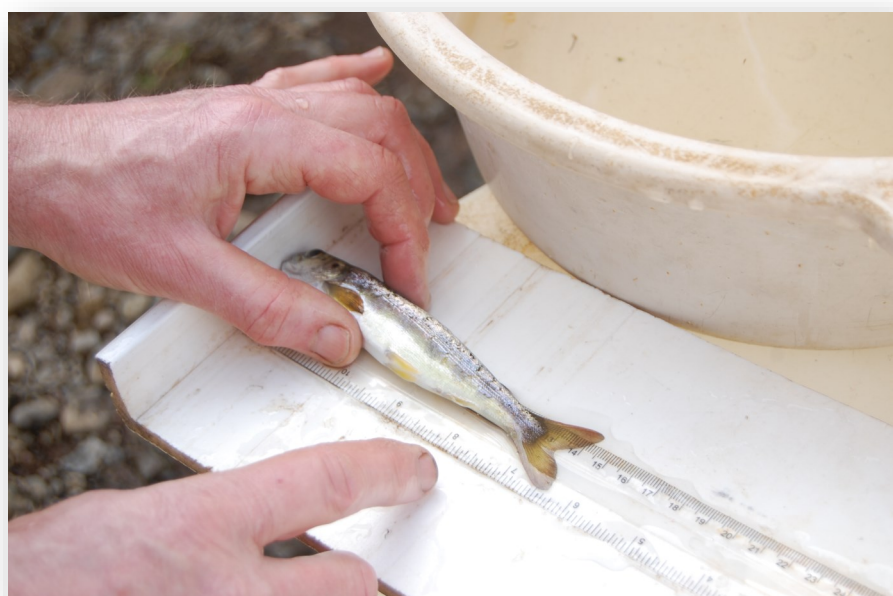
Measuring a salmon smolt for tagging