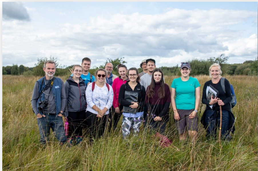
CABB project volunteers surveying for Marsh Fritillary butterfly.

RSPB NI will be writing Conservation Action Plans for the Garron Plateau SAC, Montiags Moss SAC in County Antrim and Pettigo Plateau SAC in County Fermanagh, by working with and supporting landowners as we agree plans to manage these precious sites, while Butterfly Conservation is working with landowners and volunteers at a number of sites to improve the conditions for the marsh fritillary butterfly.