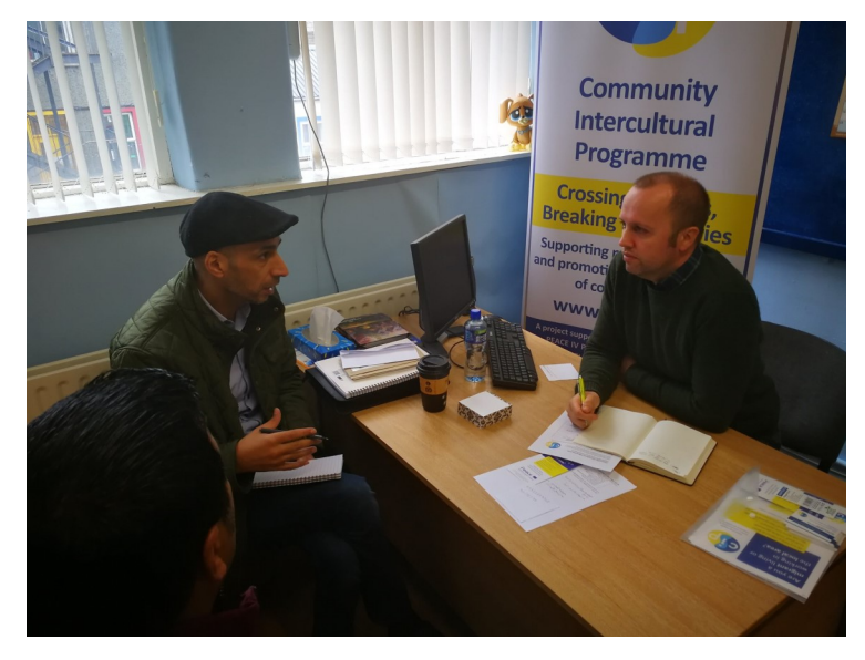
CIP Casework Session - CIP offers valuable 1-1 support with migrant workers in Portadown and Armagh

<u>Key Output</u>: Regional level project that result in meaningful, purposeful and sustained contact between persons from different communities