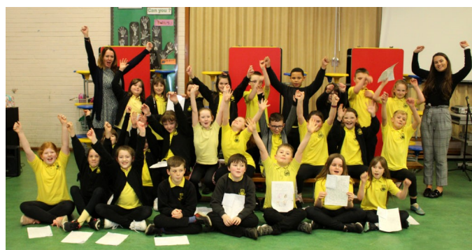
Belmont Primary pupils and their teacher