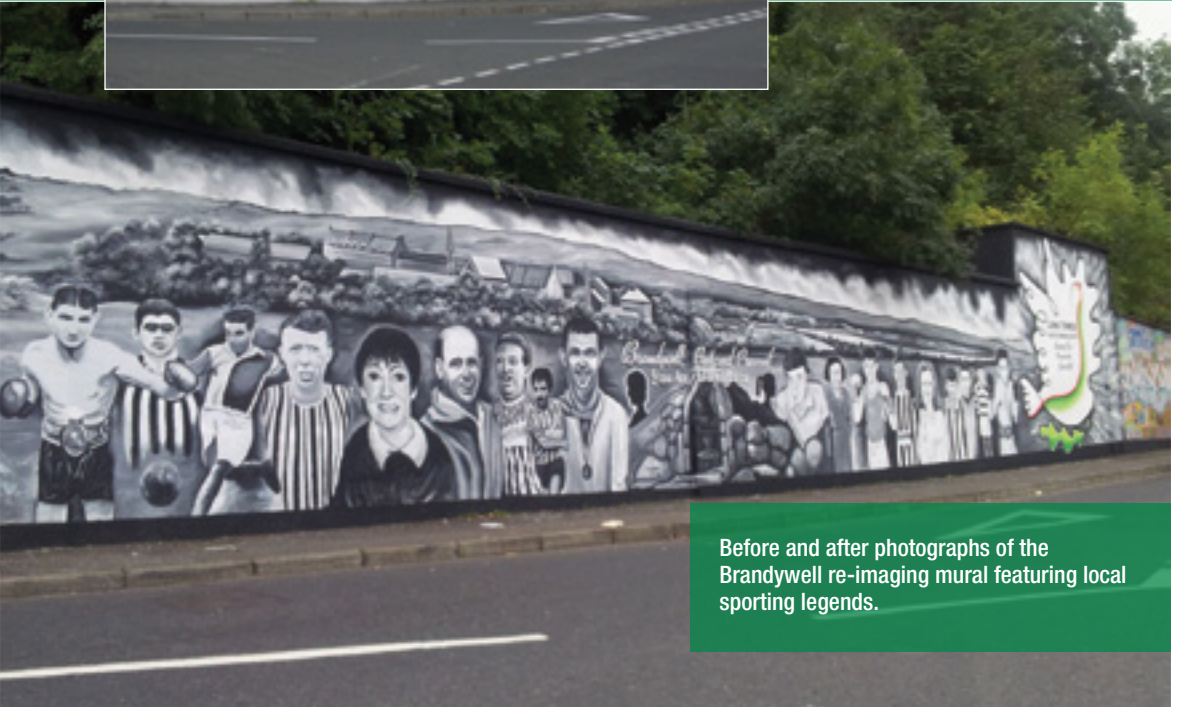
Before and after photographs of the Brandywell re-imaging mural featuring local sporting legends.